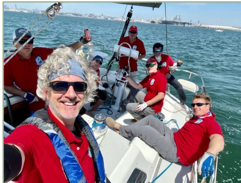
NYCSO Tiny Bubbles Crew