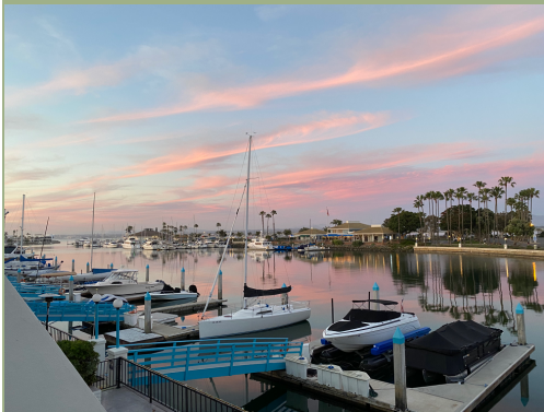
Sunset South Bay

We are certainly ready to get things rescheduled for the race calendar once the many restrictions are lifted. Depending on when that occurs we will determine the race series changes. At this point it is too early to tell what sailing window we will have to maximize the number of events and minimize risk to all concerned.