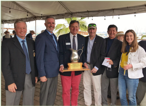
Fargo Cup Tiny Bubbles Racing Class