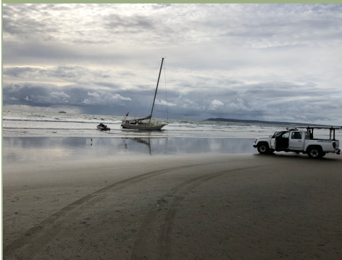
After the Storm Silver Strand State Beach

The US Sailing, One Day Race Management Seminar scheduled for April 11, 2020 had to be cancelled. As a result of the cancellation and the many efforts to continue valuable training, US Sailing developed a hosted online course and I was invited to be in attendance as the beta platform was rolled out. The individuals taking the course were about half real students and the other half were certified instructors. The course was a Zoom meeting and conducted three days in a row for 2 hours a night. I found it extremely valuable even though at times some of the other attendees asked questions from their extensive experience running international events which were way over my head.